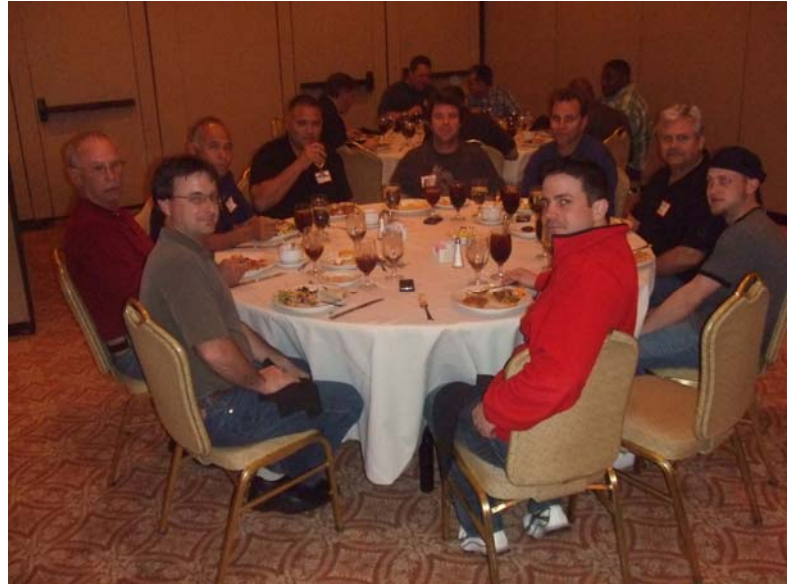
Customers enjoying their lunch break during training at Treasure Island

If you are interested in attending a future training seminar, please let us know. We can gauge possible interest and best determine when and where to schedule our next training session.